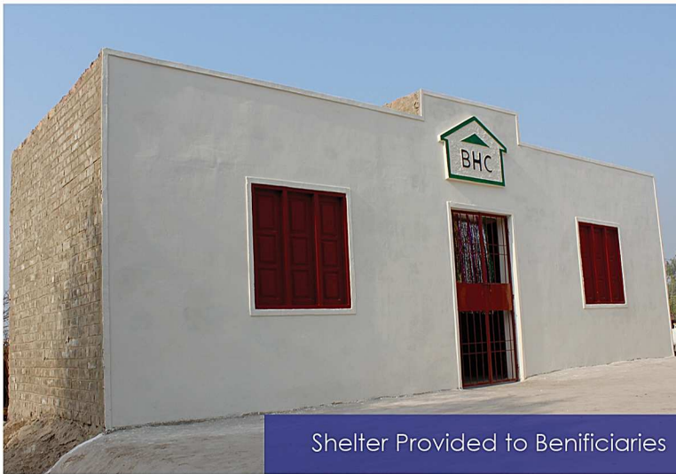
Shelter Provided to Beneficiaries

To provide food, clothing and shelter to the every person in the Pakistan was not only the vision of Shaheed Zulfiqar Ali Bhutto but it was also the slogan under which Pakistan People's Party was formed. In order to provide the house to vulnerable and down trodden people in Sindh, the Government of Sindh has established a department namely Shaheed Benazir Bhutto Housing Cell (SBBHC).