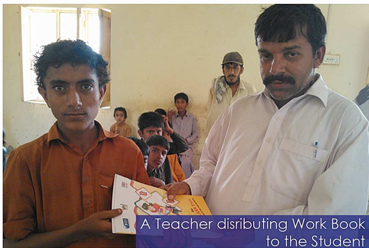
A Teacher distributing Work Book to the Student

A kit of Learning Resource Material (LRM) consisting of teachers' manuals, students' workbooks, low/no cost items including stationary, show cases for LRM and students' bags have been distributed in all 50 project targeted schools. hand pumps and latrines respectively.