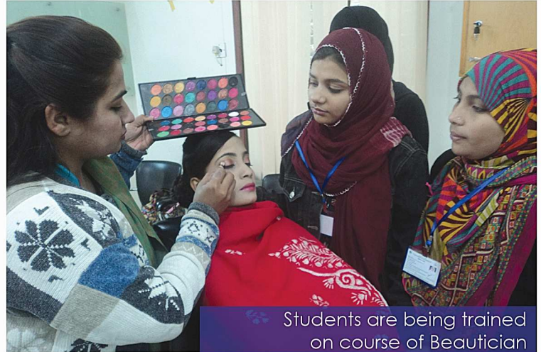
Students are being trained on course of Beautician

Government has entered into an agreement with World Bank. The Project aims to support the Government of Sindh in strengthening its training programs to improve the skills set and employability of 45,000 youth trainees in 3 years.