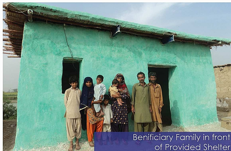
Beneficiary Family in front of Provided Shelter

One room shelter program is to provide durable shelter solutions to the most vulnerable and down trodden people affected by flood in 2012. International Organization for Migration (IOM) is working